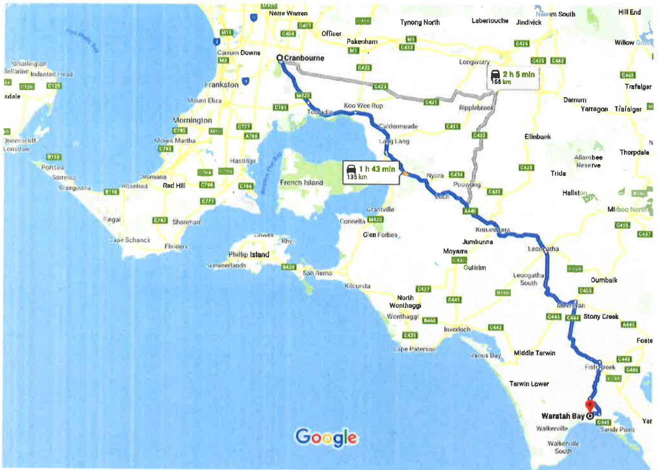
Map data ©2019 Google 10 km